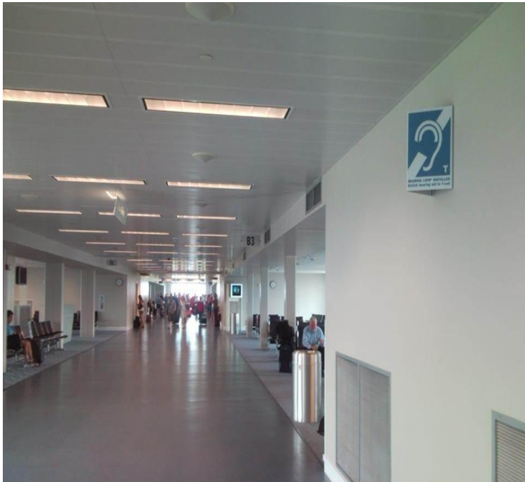
Gerald Ford International Airport Grand Rapids Michigan-USA