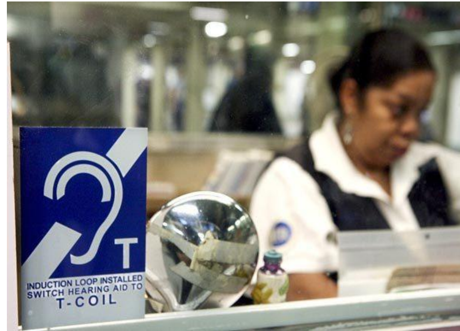
NYC Subway Ticket Booths